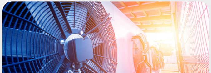
COMPRESSOR SUPPLY AIR FILTER