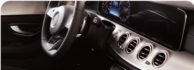
PASSENGER COMPARTMENT FILTER