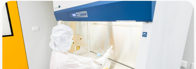
HEPA/ULPA CLEAN ROOM FILTER