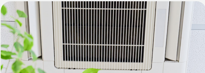
ROOM AIR FILTER