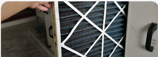
COMPRESSED AIR FILTER