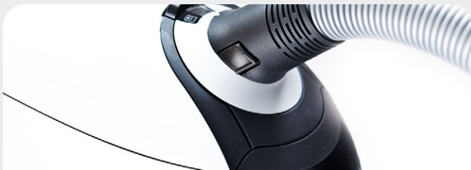
VACUUM CLEANER FILTER