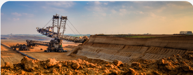
OPEN PIT MINING & LANDFILLS