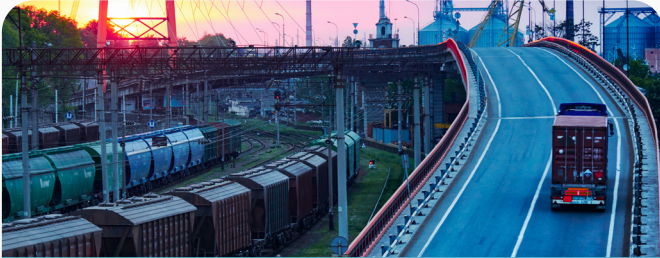
NETWORK WITH ROADS, RAILS & PORTS