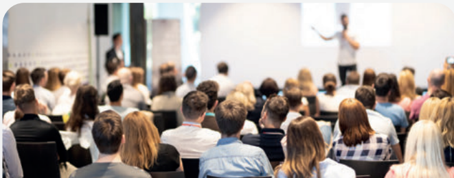
CONFERENCES AND LECTURES