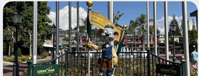
(INDOOR) LEISURE ACTIVITIES