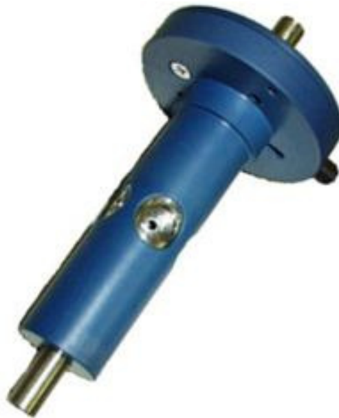
Figure 1: Heatable and pressure-resistant welas ® cuvette

Depending on the composition of the aerosol to be measured, i.e. the carrier gas component and the particle material, pressure changes in the carrier gas can significantly influence the particle size distribution, e.g. due to condensation or evaporation. For this reason, the welas ® aerosol sensors welas ® 1100 HP and welas ® 1200 HP are equipped with a pressure-resistant and heatable cuvette to ensure isobaric and isothermal sampling down to the sensor's measurement volume.