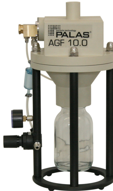
Fig. 1: AGF 10.0 The AGF 10.0 system comprises an adjustable binary nozzle for adjustment of the desired mass flow and a cyclone with a cut-off of 10 \mu\text{m} . The figure below presents a schematic arrangement of the generator components:

The AGF 10.0 is an aerosol generator for the atomization of liquids and latex suspensions with a constant particle rate and defined particle spectrum.