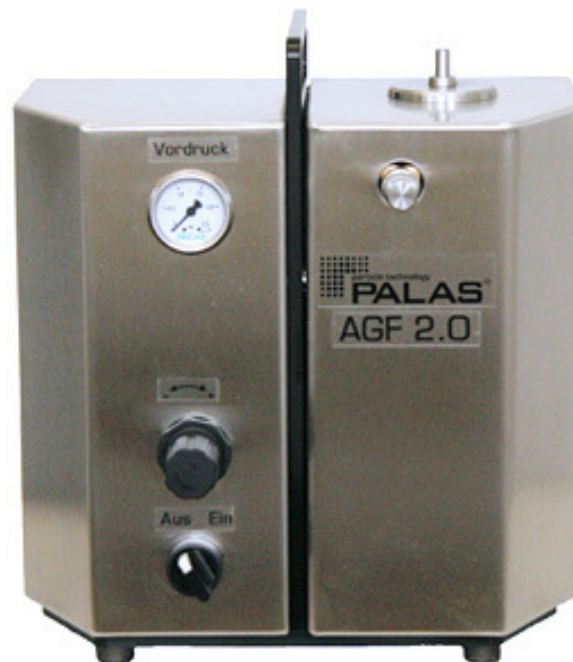
Fig. 1: AGF 2.0 The AGF 2.0 system comprises an adjustable binary nozzle for adjustment of the desired mass flow and a cyclone with a cut-off of 2 \mu\text{m} . As a result, virtually no particles > 2 \mu\text{m} are generated. AGF 2.0 functional principle

The AGF 2.0 is an aerosol generator for the atomization of liquids and latex suspensions with a constant particle rate and defined particle spectrum.