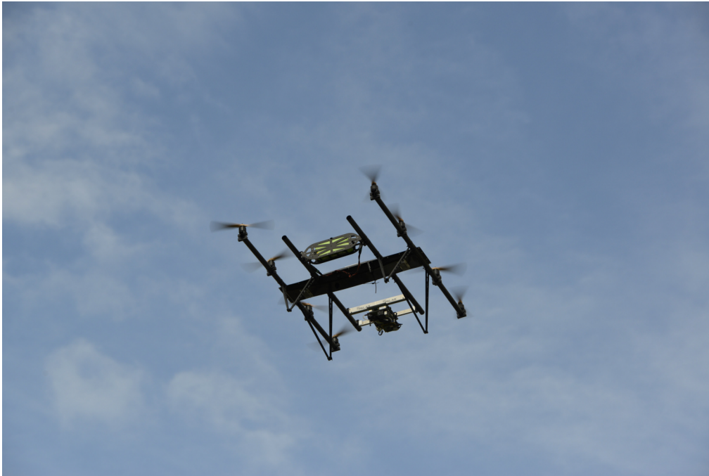
Fig. 3: Typical use of Fidas® Fly 100

Fig. 2: Comparison of the algorithms for conversion of the particle size distribution by PM values. In order to convert the measured values into a mass or mass fraction, the high-resolution particle size distribution in each value is multiplied by a correlation factor that reflects the different sources (e.g. combustion aerosols, tire wear, pollen) of the environmental aerosol (see Fig. 2). A mass fraction is obtained by additionally applying the separation curve (see DIN EN 481) to the determined particle size distribution. Multiple separation curves can be used simultaneously for the same size distribution, which enables the simultaneous output of PM10, PM2.5, PM1 (and others). For example the Fidas® Fly 100 can be operated with the same conversion algorithm, which has also been implemented in the type-approved and certified ambient air monitoring system Fidas® 200 for regulatory monitoring of ambient PM2.5 and PM10 concentrations. The delivered software allows for manifold evaluations and presentations of the measured data.