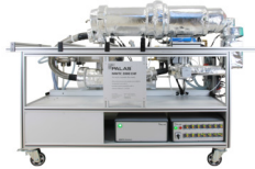
MMTC 2000 EHF Stainless steel version with heating for temperatures up to 250°C and humidity control