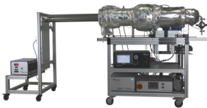
MMTC 2000 EH Stainless steel version with heating and insulation for temperatures up to 250°C