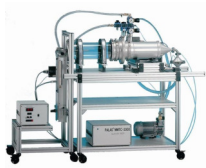
MMTC 2000 E Stainless steel version for temperatures up to 70°C