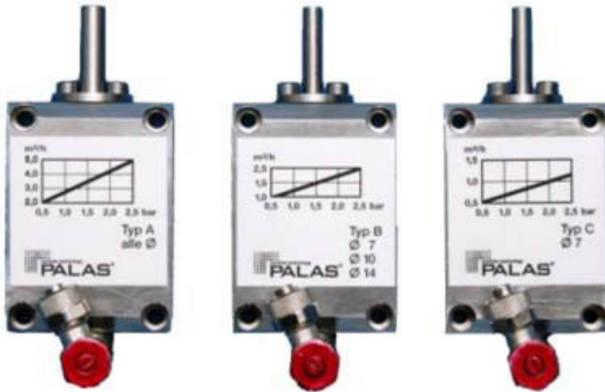
Fig. 3: Dispersing covers, type A, type B and type C Four different dispersing covers can be used for optimal dispersion (see Fig. 3, additional details under "Accessories").