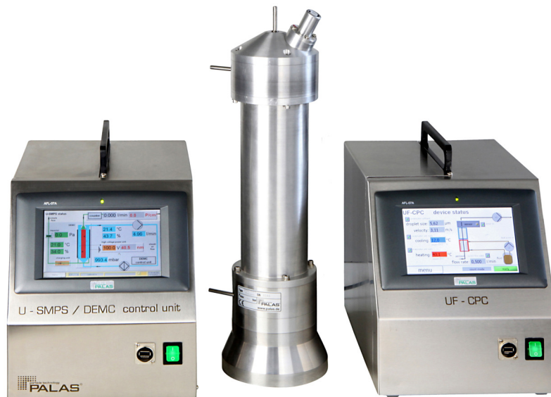
Fig. 1: U-SMPS 2050 X / 2100 X / 2200 X