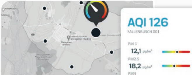
REGULATORY ENVIRONMENTAL MONITORING