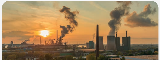
EMISSION SOURCE ALLOCATION