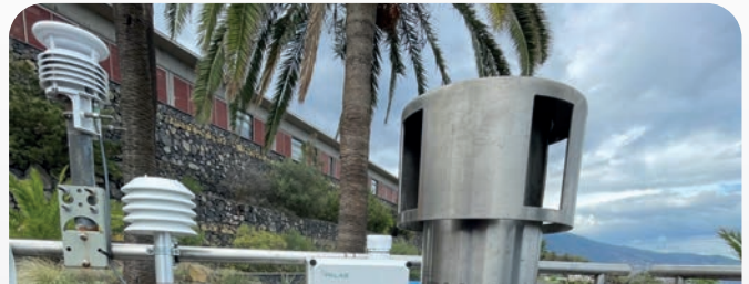
IMMISSION MEASUREMENT CAMPAIGNS