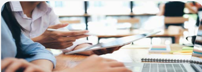
LONG-TERM MEASUREMENTS IN R&D