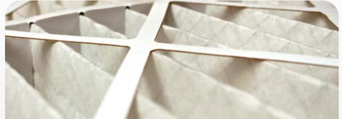
DEVELOPMENT OF NEW FILTER AND FILTER MATERIAL