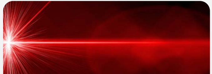
PARTICLE IMAGE VELOCIMETRY