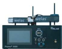
Promo ® 3000 H With heating regulation up to 250 °C for welas ® aerosol sensors