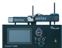
Promo ® 3000 HP With automatic regulation of sampling volume flow by the aerosol sensors welas ® under overpressure up to 10 bar or with heating regulation to 120 °C