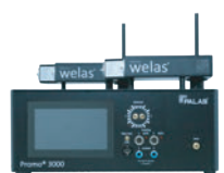
Promo ® 3000 P With automatic regulation of sampling volume flow by the aerosol sensors welas ® under overpressure up to 10 bar